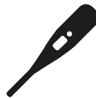
Fever or elevated temperature